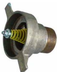
Internal By -Pass Valve (Option BY/25 & BY40)