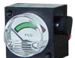
Miniature Differential Pressure Gauge (Option MDP30 & MDP40)