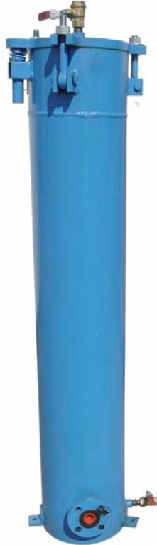
Cartridge Style Vessel (Model VFL-6036-1-2-150)

FILTER VESSELS (CARTRIDGE STYLE): Filtervac offers A.S.M.E. Code designed cartridge filter housings for a variety of liquid filtration applications. .