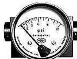
Differential Pressure Gauge (Option DP30 & DP50)