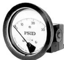
Differential Pressure Gauge & Switch (Option DPS30 & DPS50)